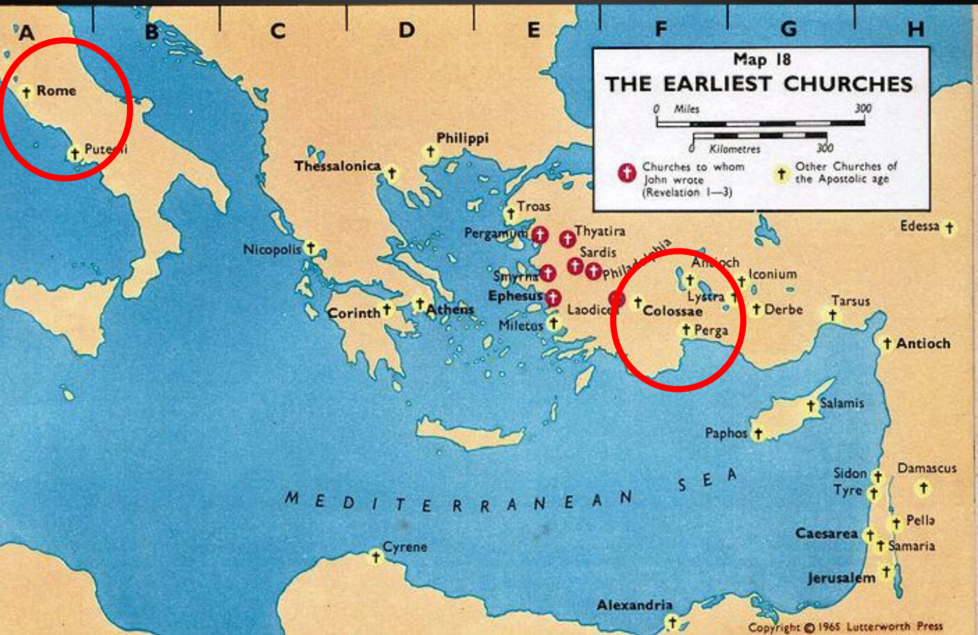
Map 18 THE EARLIEST CHURCHES 0 Miles 300 0 Kilometres 300 † Churches to whom John wrote (Revelation 1—3) † Other Churches of the Apostolic age